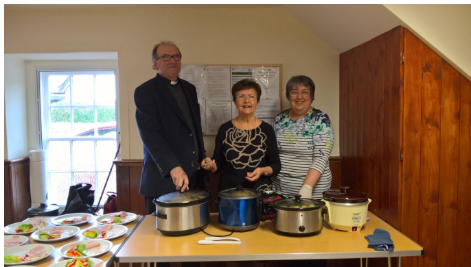
Left: The Rector about to start dispensing potatoes at St Hilary's Harvest Lunch

With a glass of wine or something non-alcoholic, the meal was completed by delicious trifles, tea or coffee and a chocolate mint. A raffle concluded another good time of fellowship.